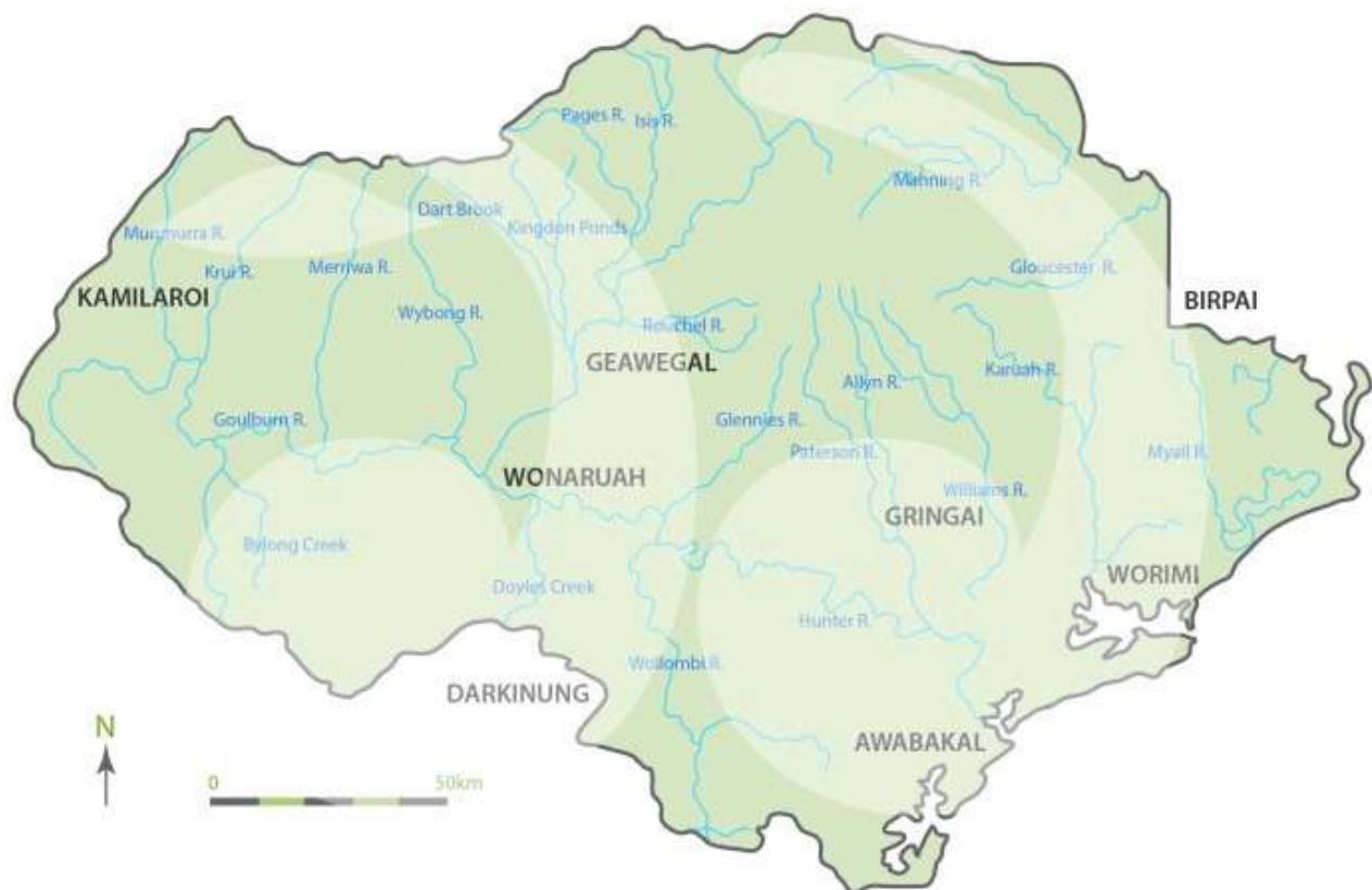
Major Tribal Groups in The Hunter Region

We recognise the significant contribution of Aboriginal and Torres Strait Islander peoples to our game.