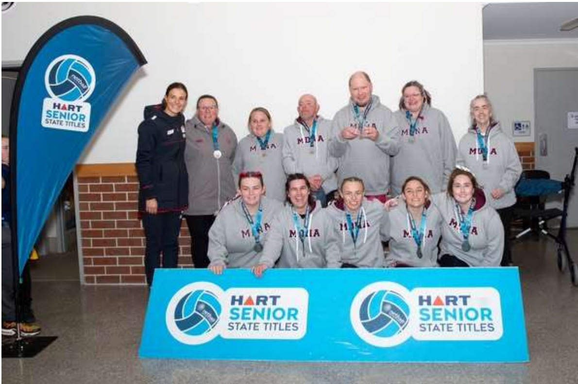
Maitland All-Abilities Runners Up

Maitland Netball Association dominated at Senior State Titles with their All-Abilities Netballers coming home Runners Up in 2025.