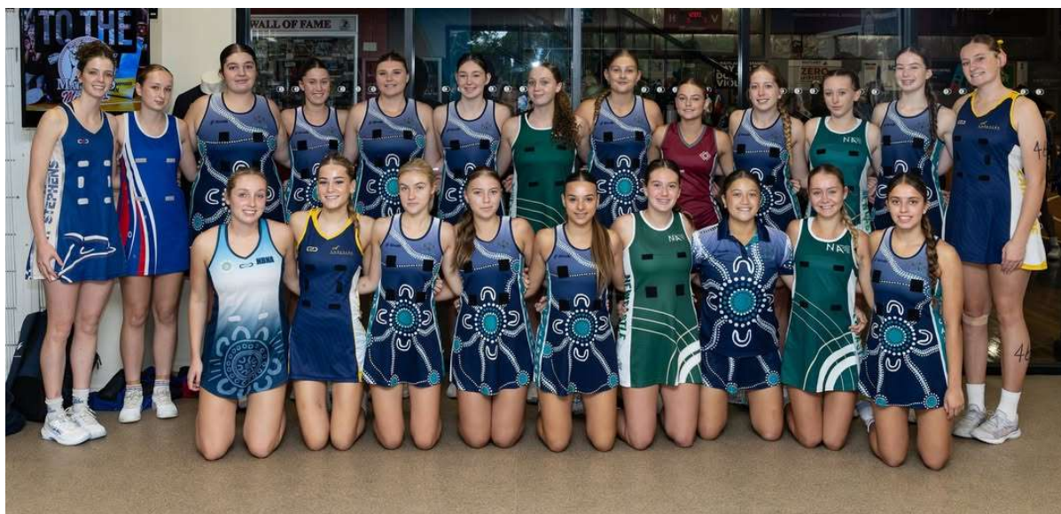
Hunter Netball athletes representative of our region.