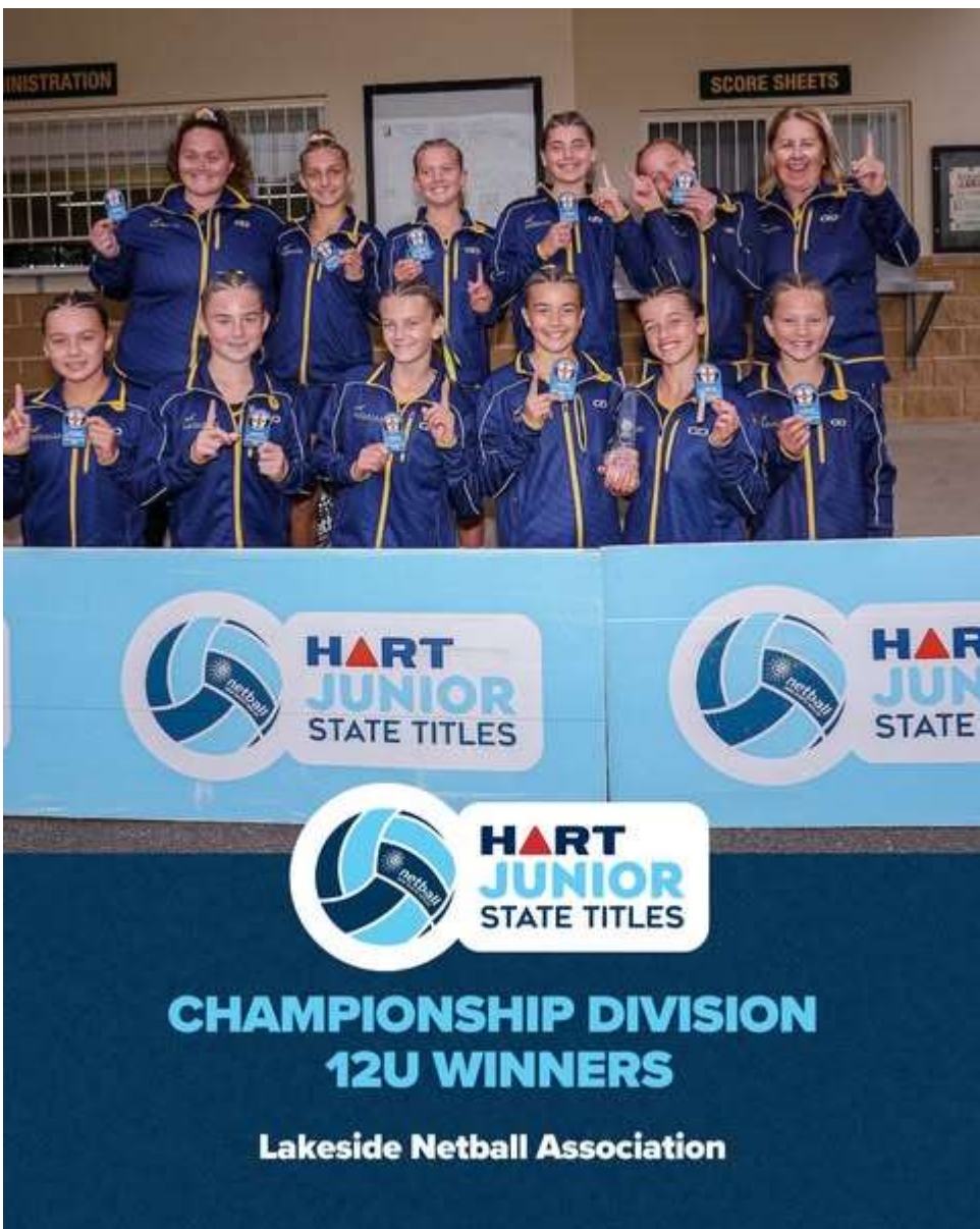
Lakeside 12s Winners Championship Division