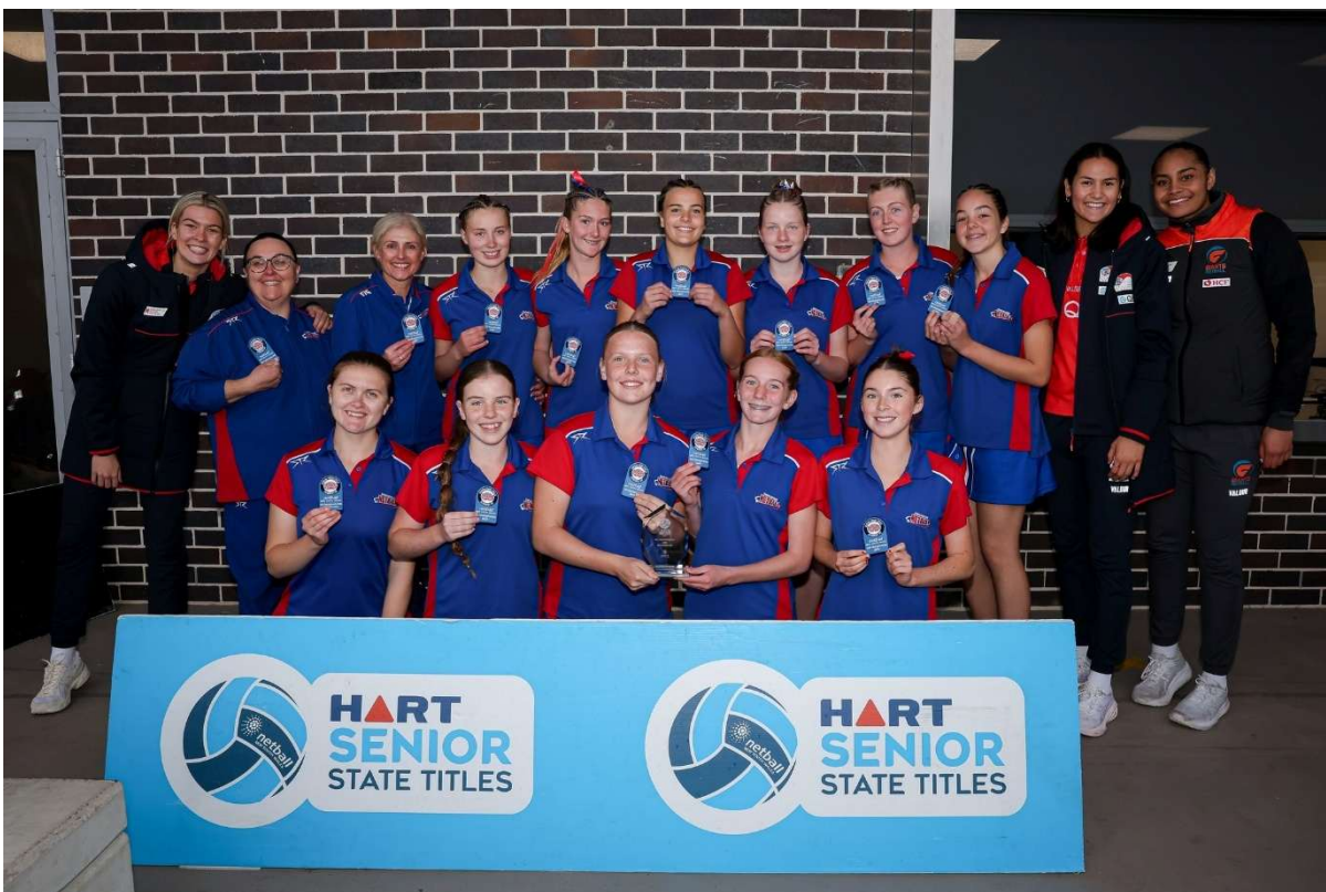
Charlestown 15s Runners Up Championship Division