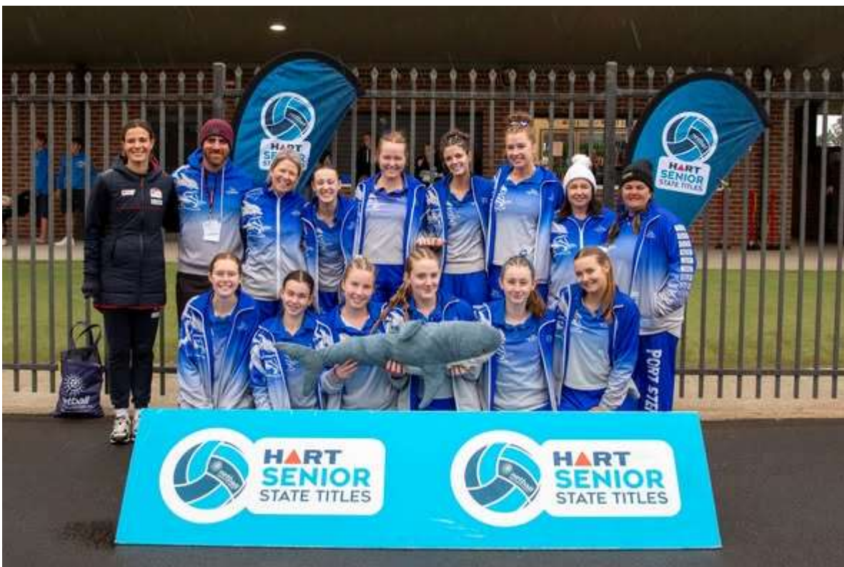
Port Stephens 17s Winners Division 4